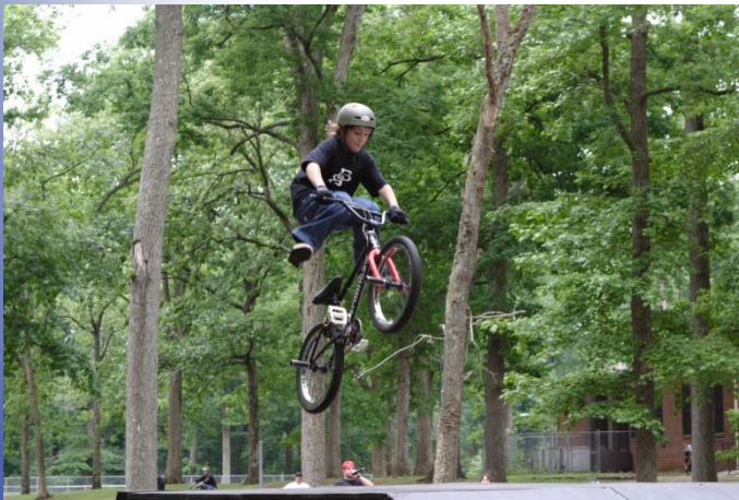
Stunt Bike Show