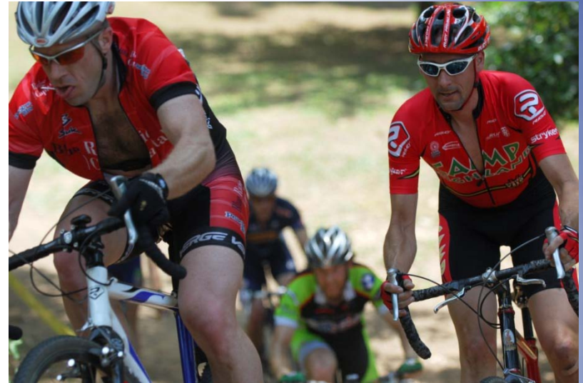
Cross Track Race